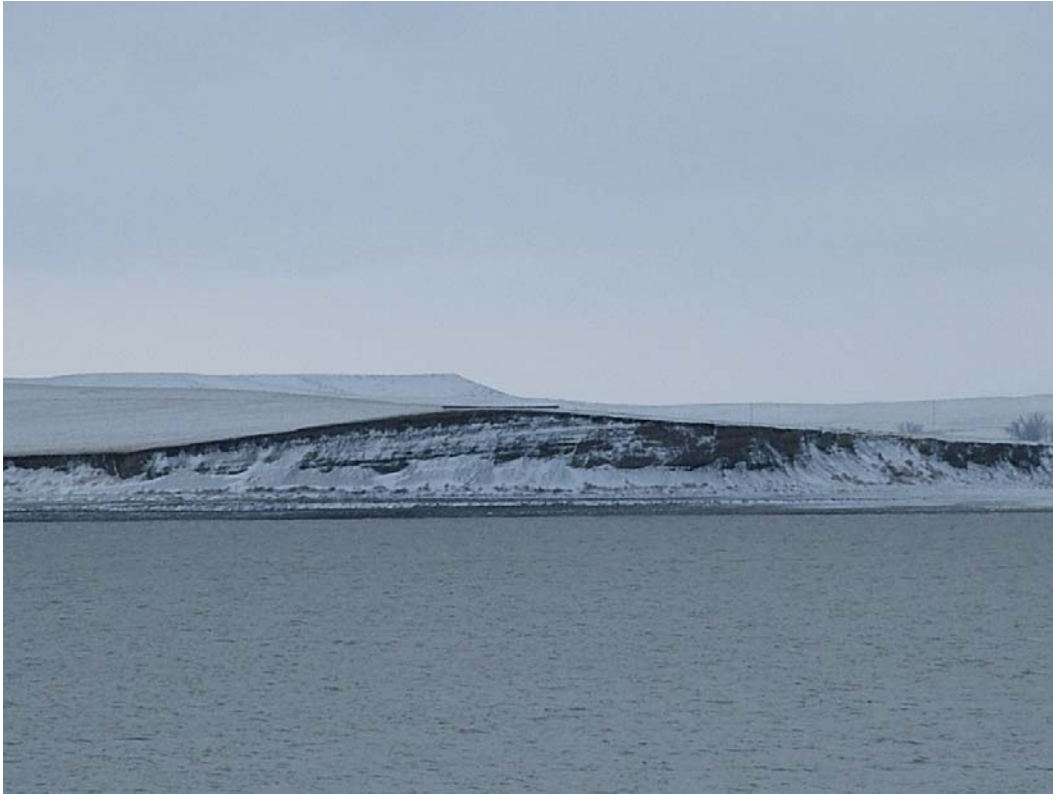
Figure 6 - Eroded shoreline of Belle Fourche Reservoir, South Dakota.

The above photographs show the extent of the shoreline erosion that has occurred throughout Belle Fourche Reservoir. If the erosion were just below the normal reservoir high water elevation of 2,975.0, the total volume of the reservoir would not be greatly affected from elevation 2,975.0 and below. In that case, the gain in surface area and resulting volume in the upper reservoir elevation zone would be offset by the loss of surface area and volume in the lower elevations of the reservoir due to the depositing material from the banks. For Belle Fourche Reservoir, it appears that a large amount of the bank erosion has occurred above the normal or conservation reservoir elevation 2,975.0. This indicates that a portion of the loss of the original total reservoir volume is due to material from the extensive reservoir shoreline erosion along with inflowing river sediments. The only means to accurately measure the extent of the shoreline erosion would be by an extensive above water survey.