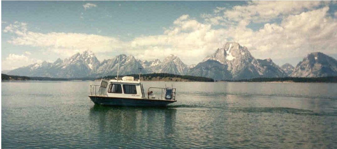
Figure 3 - Survey vessel with mounted instrumentation on Jackson Lake in Wyoming.

The Sedimentation and River Hydraulics Group uses RTK GPS with the major benefit being precise heights measured in real time to monitor water surface elevation changes. The basic output from a RTK receiver are precise 3-D coordinates in latitude, longitude, and height with accuracies on the order of 2 centimeters horizontally and 3 centimeters vertically. The output is on the GPS datum of WGS-84 that the hydrographic collection software converted into South Dakota's state plane coordinates, north zone in NAD83. The RTK GPS system employs two receivers that track the same satellites simultaneously just like with differential GPS.