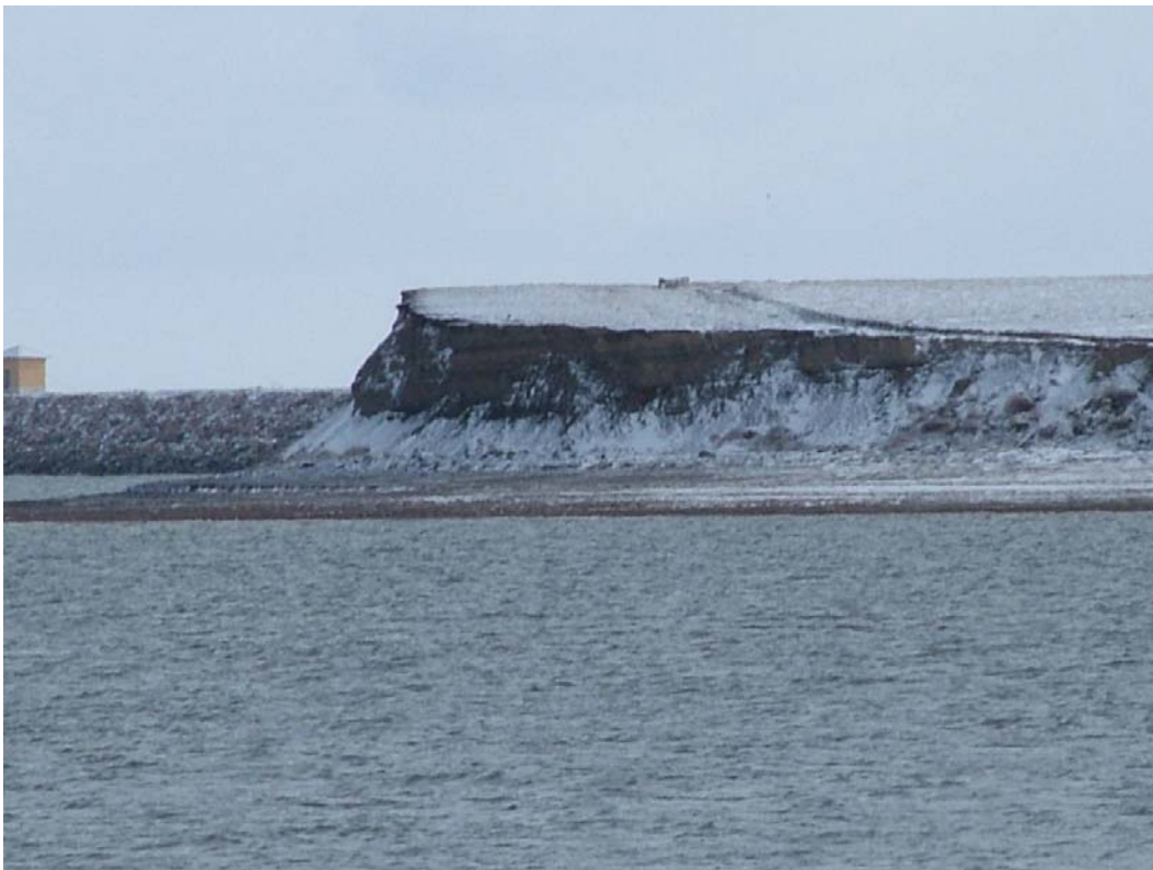
Figure 5 – Extensive eroded shoreline looking towards Belle Fourche Dam.

The 2006 underwater survey witnessed and measured the extensive erosion along the shoreline of Belle Fourche Reservoir. During collection, the GPS boat positions were found at times to be outside the digitized USGS quad contour locations, indicating the boat was on solid ground. The USGS quad contours were developed from aerial photography flown in the 1940's and 1960's and at times, the position of the boat was tens-of-feet outside the 2,970 contour boundaries. Even with the extensive shore erosion that has occurred since dam closure in 1910, the survey vessel was able to maneuver close to some vertical banks where previous shore material had collapsed into the reservoir. It appears that over time the collapsed material washed further into the reservoir through wave action, similar to ocean waves smoothing the beaches. This is possible because the material dissipated in the water and consists of little to no gravel or large cobble. The extensive shoreline erosion was documented by the 1949 survey of Belle Fourche Reservoir. At reservoir elevation 2,975.0, the 1949 study measured 44.45 miles of shoreline and estimated that of the 16,880 acre-feet of capacity loss due to sedimentation, 4,320 acre-feet was due to shoreline eroded material settling within the reservoir (Bureau of Reclamation, 1950). Following are pictures showing the shoreline erosion along Belle Fourche taken in March of 2007, figures 5 and 6.