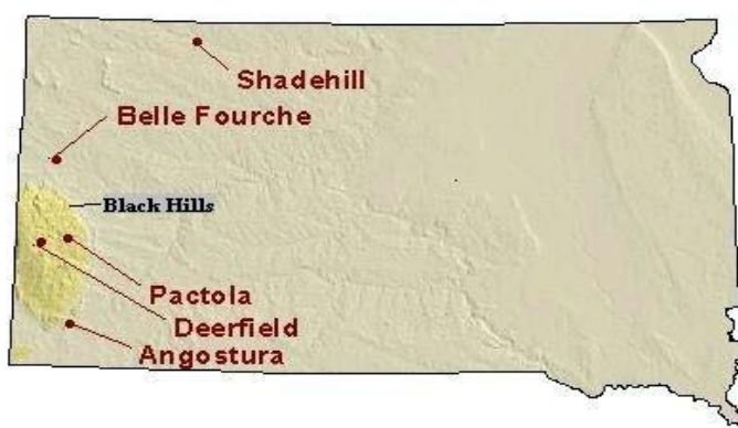
Figure 1 - Reclamation reservoirs located in South Dakota.

Belle Fourche Dam and Reservoir are principal features of the Belle Fourche Unit located in western South Dakota. Additional project features are Belle Fourche diversion dam, inlet canal, and system of canals and laterals that irrigate acres near Newell, Vale, and Nisland, South Dakota. The reservoir stores water from Owl Creek and diverted flows from the Belle Fourche River. The project was a single purpose development for irrigation, but provides flood control, fish and wildlife conservation, and recreation benefits. Belle Fourche Dam and Reservoir in Butte County near Owl Creek is an offstream reservoir, located on the northern edge of the Black Hills, nine miles east of Belle Fourche, South Dakota (figure 1).